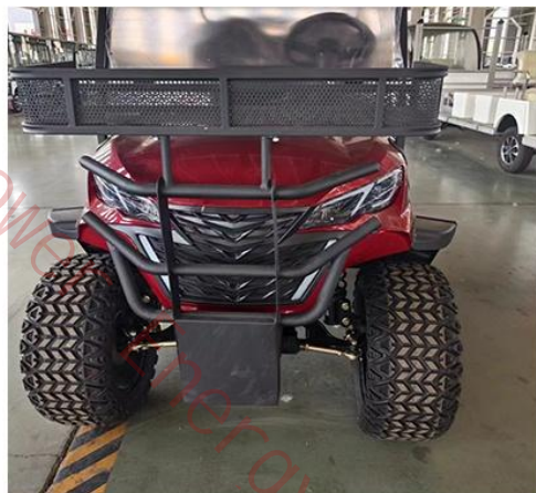
MacPherson independent suspension