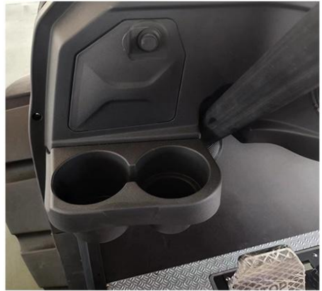
Large capacity storage box and cup holder