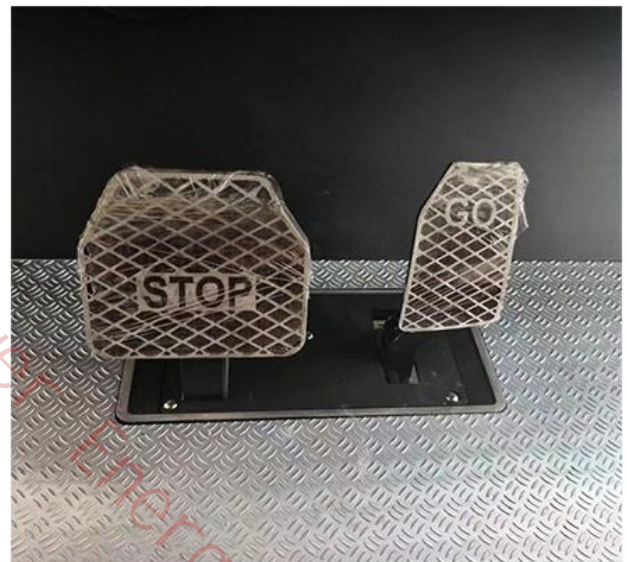
Metal material integrated pedal