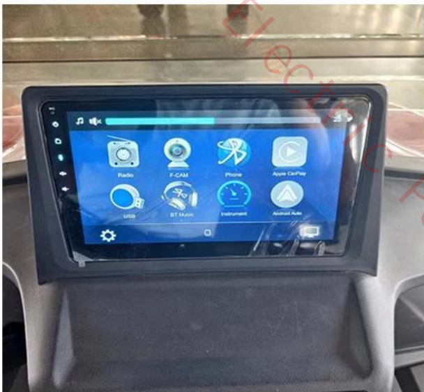
10 inch multimedia display screen (Capulet system)