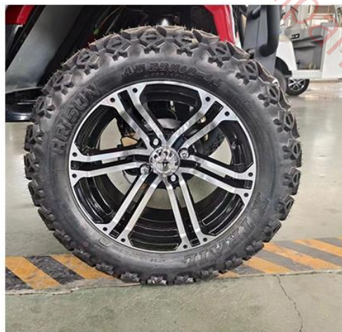
Aluminum alloy 14 inch off-road tires