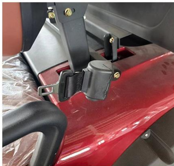
Retractable seat belts