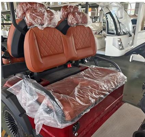
Luxury sofa seats