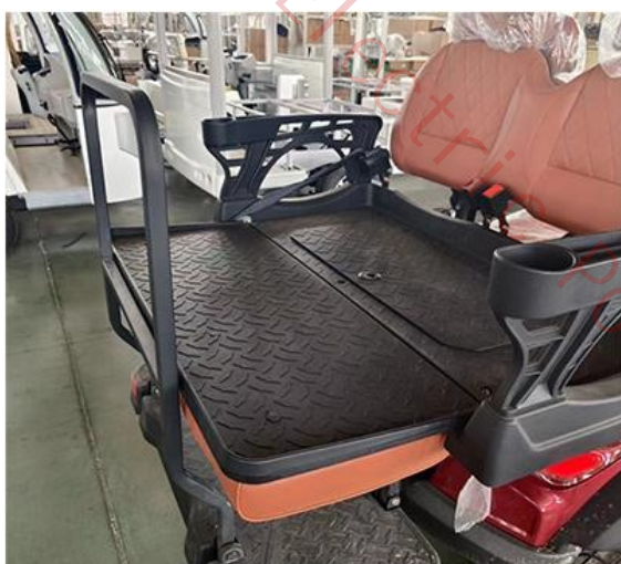
Rear folding seat bracket +storage box