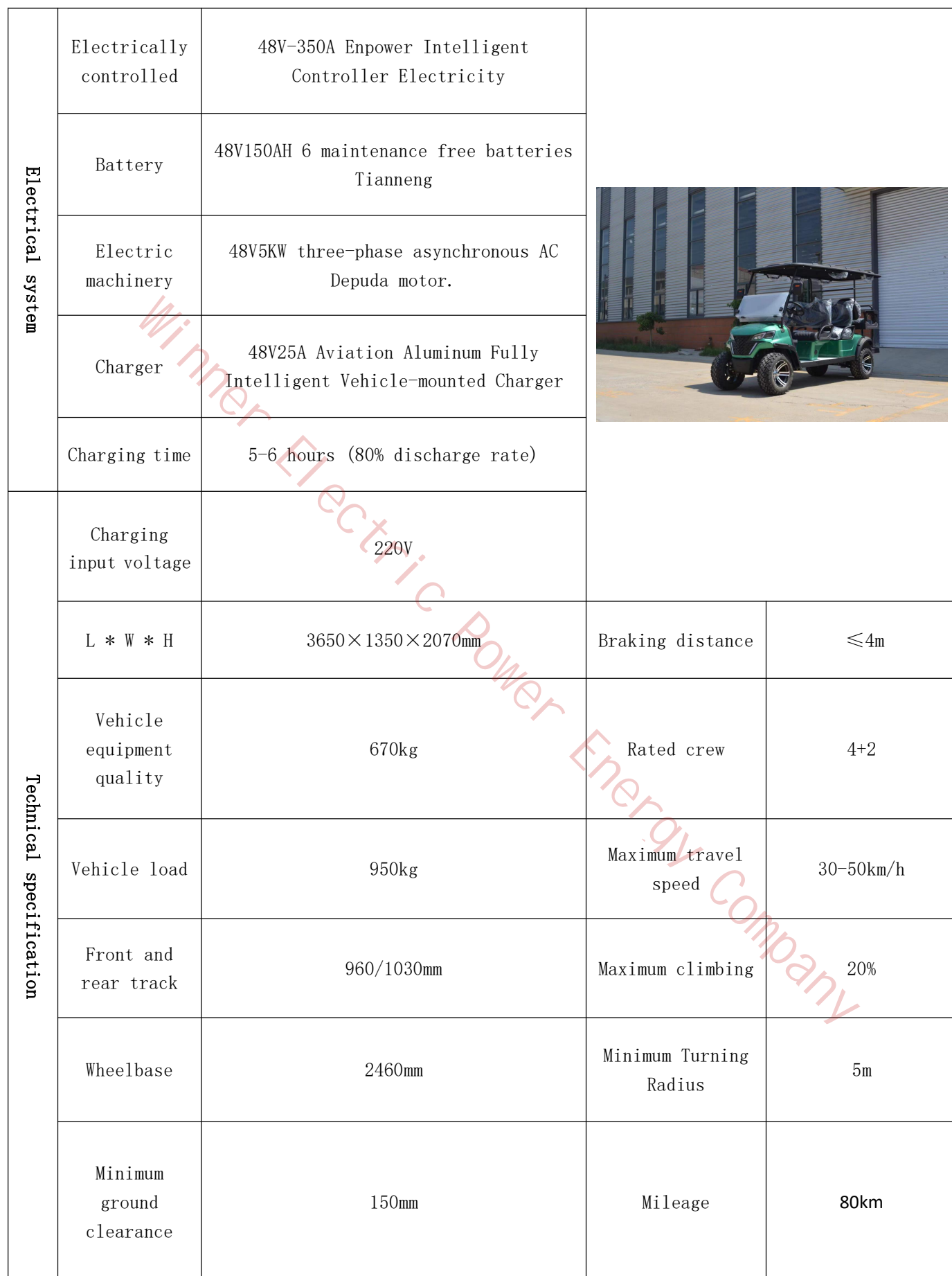
WINNER-GC 4S+2S 48V Configuration Table