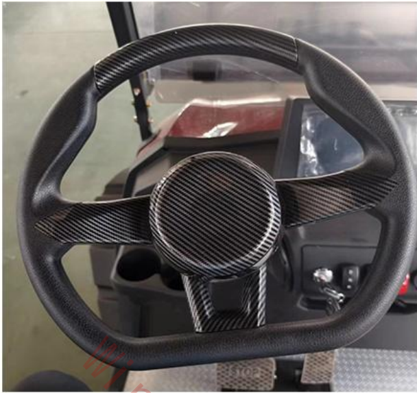
Carbon fiber steering wheel